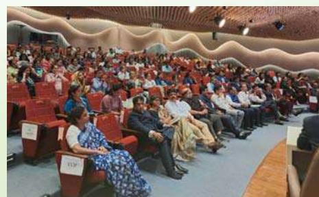
Department of Forensic Medicine and Toxicology, SAMG&PGI