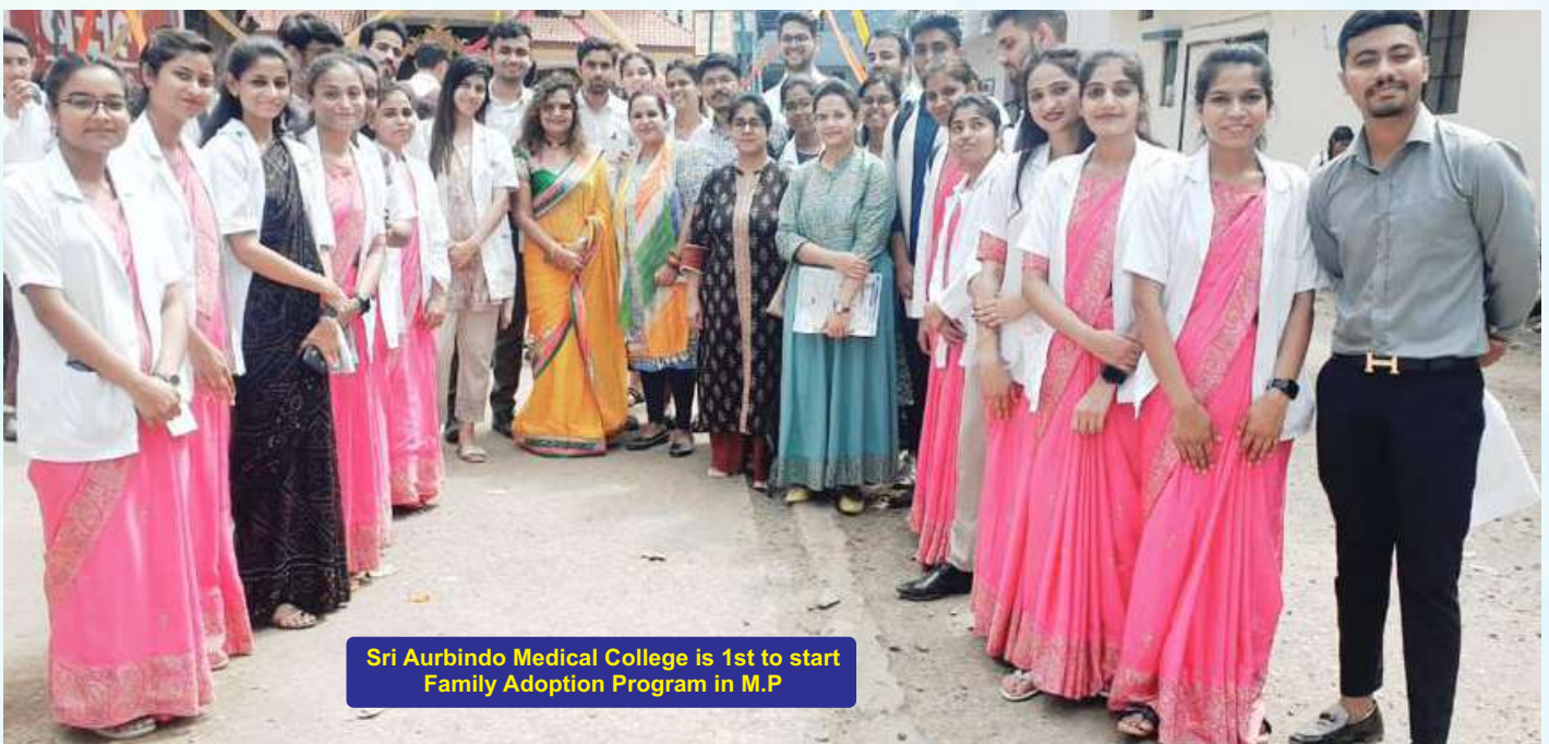
Sri Aurobindo Medical College is 1st to start Family Adoption Program in M.P