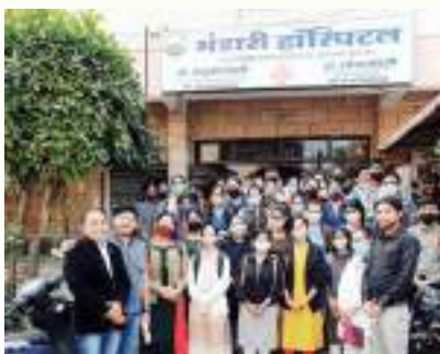
Visit to Urban Health Training Centre on 25/2/2022