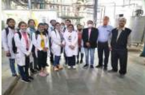
Visit to Water Purification Plant on 11/2/2022