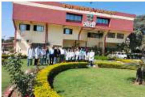
Visit to Dairy Mangliya Indore on 21/2/2022