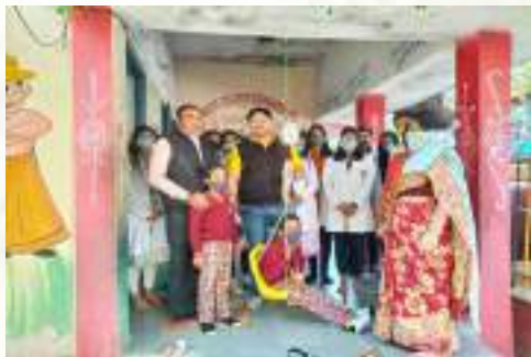
Visit to Anganwadi on 17/2/2022