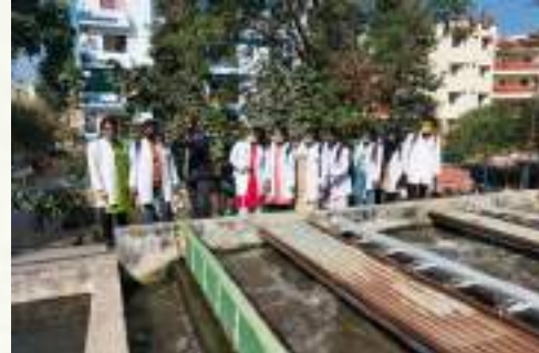
Visit to Sewage Treatment plant Saims Campus on 15/2/2022