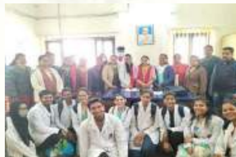
Visit to State Malaria Unit on 18/2/2022