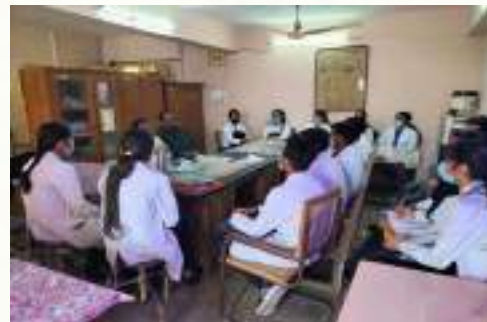
Visit to Office of Born Disease Control Program on 24/2/2022