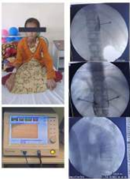
Case 1: Chronic pancreatitis; Images showing cachectic patient, needle placement in anteroposterior and lateral view with contrast spread and Radiofrequency machine delivering thermal ablation