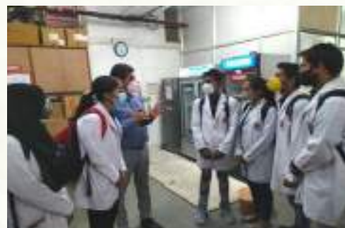
Visit to Hospital Pharmacy on 26/2/2022